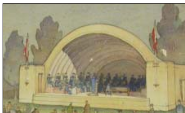
Detail from one of the designs for the Kings Park bandstand, State Records Office of WA, WAS 1322, Consignment 5092.