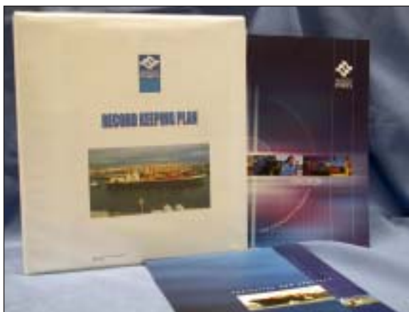
The Fremantle Ports Recordkeeping Plan.

The Ports' Records Management policies and procedures ( Principle Two: Policies and Procedures ) are identified and listed. Each policy has a unique identifier (number) and each policy is endorsed and approved by the Manager Administration. An approval sheet is included with policies and index to all Records Management policies is given. Examples of electronic and email policies are also included in an appendix.