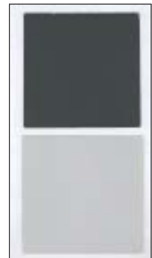
Layout of technical targets used in microfilming.

Bibliographical targets provide clients with details about the records: the creating agency, the Series type and Consignment details and item listings. Other material like maps will have a ruler on the filmed image to facilitate reproduction to original scale if required.