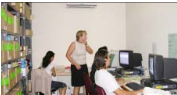
The "WA Inc" Records Project Team at work.

As there was no index or finding aid to accompany the records when transferred to the State Records Office, all boxes are being examined and the microfiche of registered records is being used to check whether records are present. To date, all the exhibits (7,454) have been checked and processed for consignment. Checking and processing of the general records is in progress.